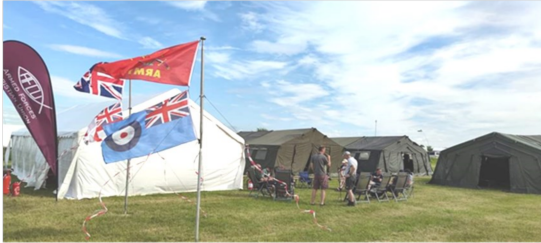
[Above & Below] The white tent is the mess tent, and the big green tents are where we slept (10 men to a tent).