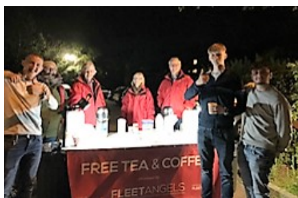
Our stall all set up to serve the community