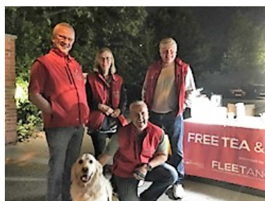
We even have Bailey, a 2 year old Golden Retriever, patrolling with us occasionally