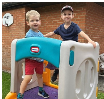
Having fun at our summer activity mornings