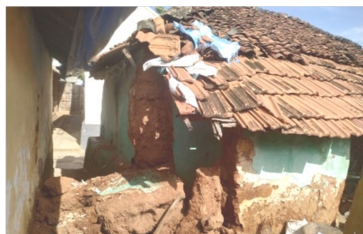
Traditionally-built houses cannot withstand the monsoon rains