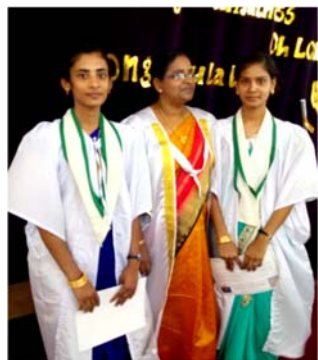
The midwives we started sponsoring in 2016 are now fully qualified and at work in the community.

We started helping the mission in 2016 and have raised £6,000. This has been used to support two young girls to train as midwives. They are now qualified and working at the Mission Hospital. A further two girls are currently training to be community nurses. We have also set up various other projects and wish to continue supporting the Mission in whatever way we can.