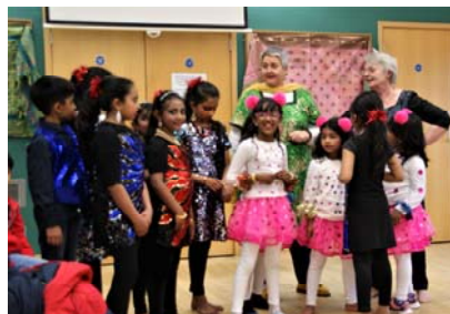
Children from the Aldershot Malayala Association

We have a few more events planned for the next few months, so here are some dates for your diary: