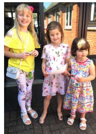
Working out clues for the scavenger hunt

We have also learned about the Transfiguration of Jesus, and discovered how many different words we could make from the word 'Transfiguration'. We found over 70—we challenge you to find as many!