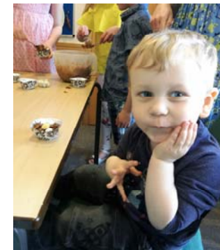
Making chocolate nests

Footsteps have been very busy making things this term: icing biscuits to share with the congregation in celebrating the return of the Prodigal Son, and also creating scratch art key rings and fridge magnets to show beauty and hope coming from darkness, when our story was the parable of the fig tree. We had an active session on making choices when talking about the temptations of Christ, stepping each side of a dividing line to choose which foods and activities we enjoyed more (eg cake or ice cream, chips or mash), and which options we should be doing more (smiling and being friendly or frowning and being grumpy). We then talked about and recognised our own personal temptations and stuck them to empty tin cans, shooting them away using Nerf Guns™.