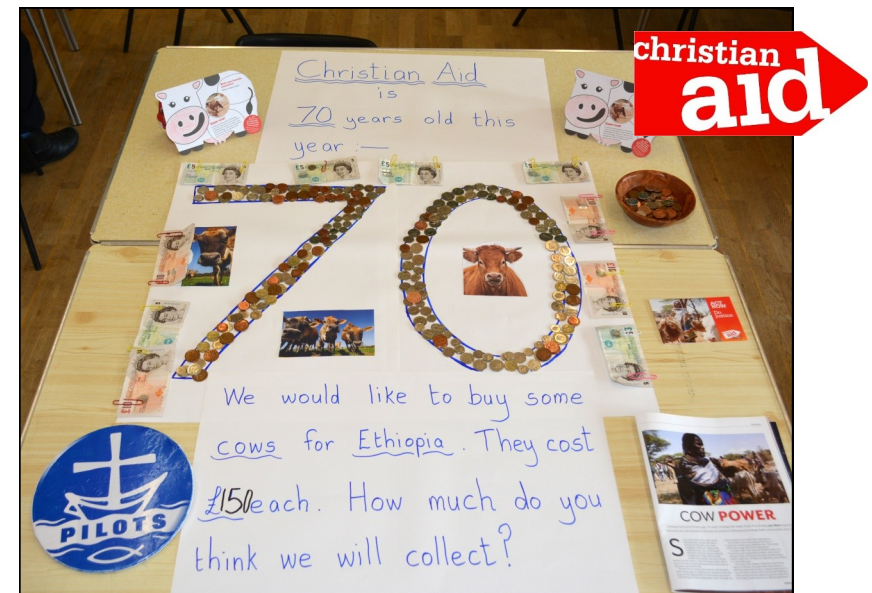
[70 years of Christian Aid—see page 9]