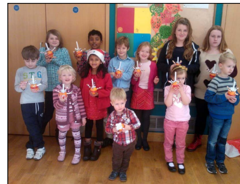
Our children with the Christingles they made for the Christmas Christingle and Carol Service.

We learned of the story of the candy cane, how in the 18th Century religious persecution in parts of Europe meant that to display a cross or a Bible was forbidden.